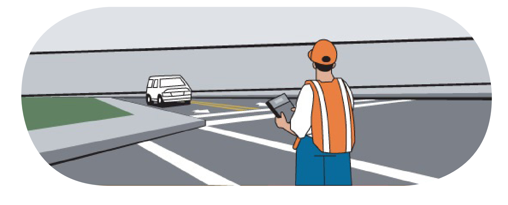
Common traffic study done by human counters