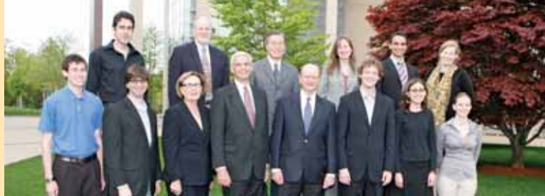
Miller Fellowship recipients, with donors and faculty, summer 2009